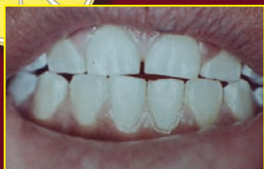
Early lemon erosion