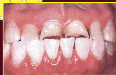
Advanced lemon erosion