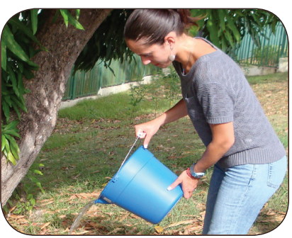
Drain & dump any standing water