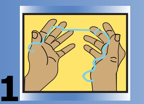
Use about 18" of floss, leaving an inch or two to work with.

Floss at least 2 times a day for healthy gums.