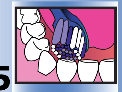
Brush the inside of your front teeth by tilting the tooth-brush vertically and using an up and down circular motion.