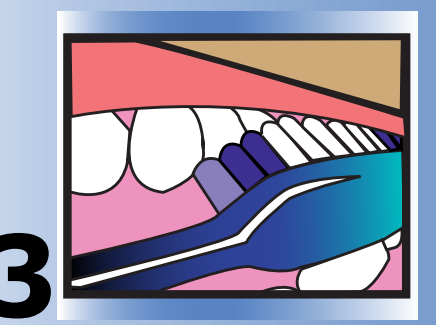
Next brush your back teeth on the outsides of your back teeth using a circular motion starting at the gum line.